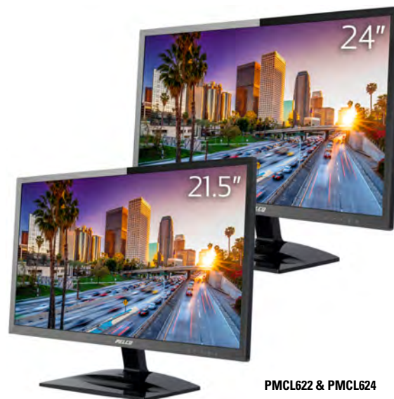
PMCL622 & PMCL624

Pelco's PMCL600 Series monitors combine the latest technologies into a perfect complement to your investment in megapixel imaging and performance. Desktop full high-definition (FHD) monitors deliver 1920 x 1080 resolution and are specifically engineered to exceed the demands of surveillance operators.