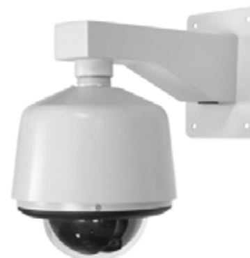
ENVIRONMENTAL PENDANT BB4-PSG-E AND LD53PSB-1 (SHOWN WITH IDM4012SS WALL MOUNT)

Pelco's Stainless Steel Spectra® IV SE Series is designed for harsh environmental installations and meets NEMA Type 4X and IP66 standards.