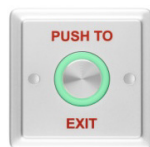
Figure 2: EX-M04 button switch with a green LED ring and 'PUSH TO EXIT' text.