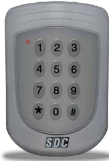
E4KP Access Control

HID ProxCard® II & ProxKey® II are registered trademarks of HID Corporation