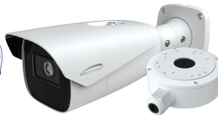
Included Junction Box