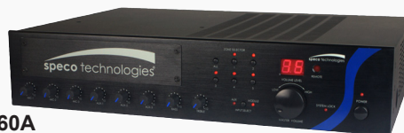
PBM60A PBM120A PBM240A