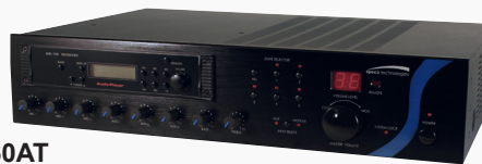
PBM60AT PBM120AT PBM240AT