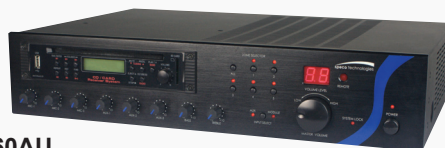
PBM60AU PBM120AU PBM240AU