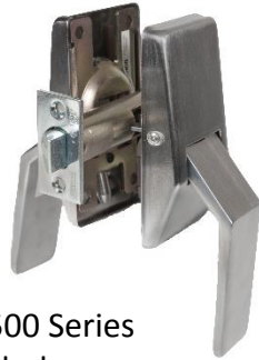
1500 Series Tubular