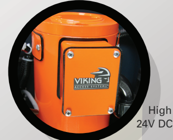
High Efficency 24V DC 2 HP Motor