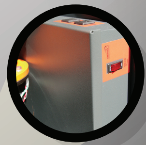
Modular Power Supply