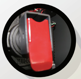
Manual Release for effortless manual operation while maintaining limit positions.

The Q-7™ incorporates a powerful and efficient DC motor, a high capacity power supply, an integrated battery back-up system and intelligent controller. The incorporation of these features results in outstanding performance on heavy duty slide gates. Equipped with a Mechanical Release mechanism providing a convenient reliable solution for manual operation. The Q-7™ brings the advantages of DC gate operators into heavy duty applications. Made in the USA of imported and domestic components.