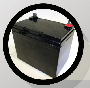
Standard 24V 35Ah Battery Backup in case of power failure

Built-in optional Auto-Open Feature in case of power failure