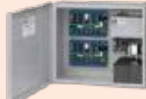
634RF x 2-UR4-8 x 2 RB12V7

see page 273 for more info on control modules