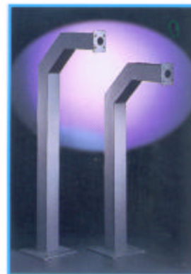
Optional Pedestal Mounts