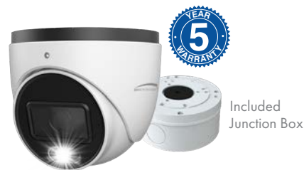
Included Junction Box