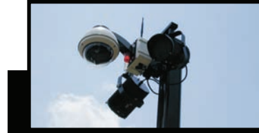
Video Surveillance Rated