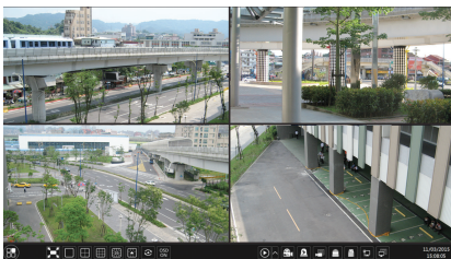
Local Management, Viewing Interface & Remote Viewing with Web Browsers