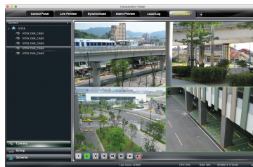
Remote Viewing Using Mac OS X