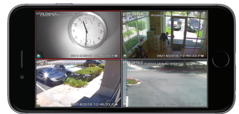
Apps Available for iPhone, iPad, & Android Devices